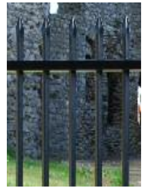
Vertical pales to have gaps of no more than 100mm.