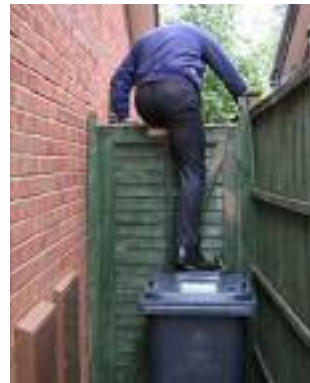
Climbing aids around the fence should be removed.