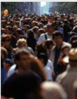
As a rule of thumb any security topping should not be fitted where the general public could accidentally come into contact with it.