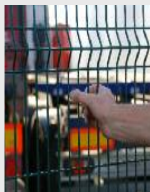
No footholds to aid climbing, rails should ideally be more than 1.5m apart.