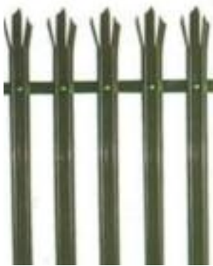
No splay - cut spikes that could trap fingers and leave someone hanging.

The need for security must always be balanced with safety considerations. Sometimes / often a high fence will be safer than a lower fence. Equally if the fence has a fierce deterrent, it may again be safer than a spiked top to a railing. Always check if an opportunity exists for an intruder to take the fence apart to gain entry. If this is not spotted, children can be put at risk, for example if they can gain access to a factory which deals with hazardous chemicals. This is why Gate Safe recommend tamper proof fixings for fences and gates.