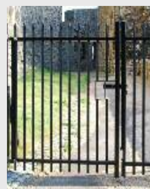
No gaps over 100 mm under fences or gates. All pinch points on gate minimised.