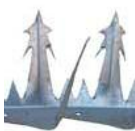
No fencing spikes where you could fall on them, typically 2.5m high and over, barbed wire and razor wire should be considered as spikes.